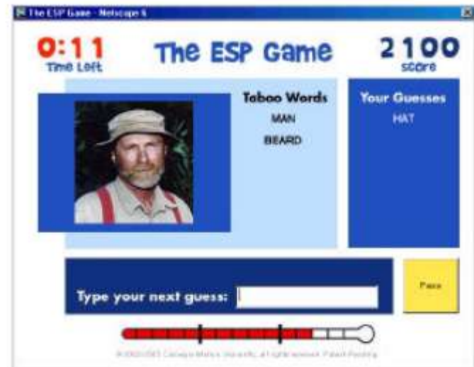
Figure 2. The ESP Game. Players try to "agree" on as many images as they can in 2.5 minutes. The thermometer at the bottom measures how many images partners have agreed on.